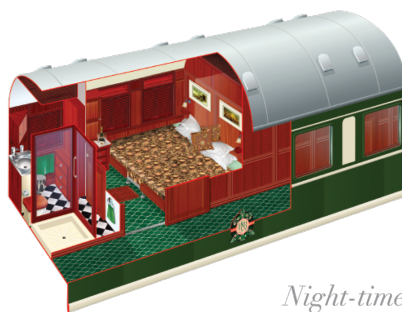
Night-time double bed

Tea drawer, air conditioning, fold-out writing desk, luggage shelf, cupboards, safe, en-suite bathroom with shower, toilet and basin.